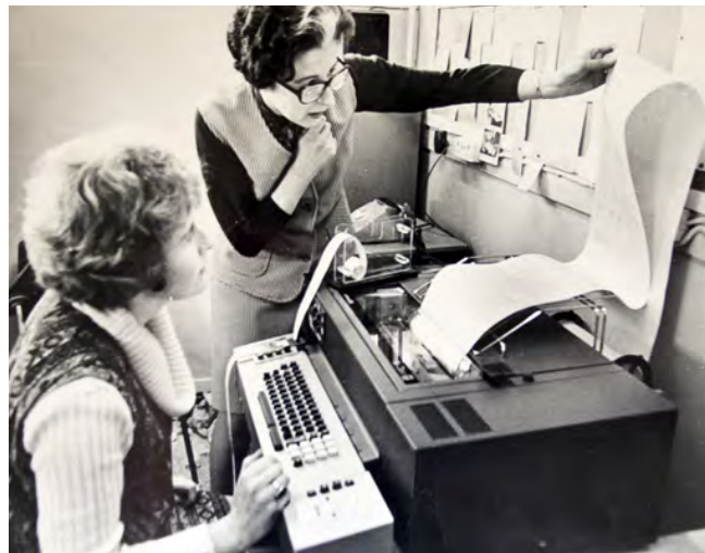
1970 The schools first computer

The next Open Archive Day will be on May 1st, 11am-1pm, in the school hall, and all are welcome to come along.