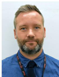
Warren Nolan Creative Media