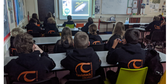
Live from COP26