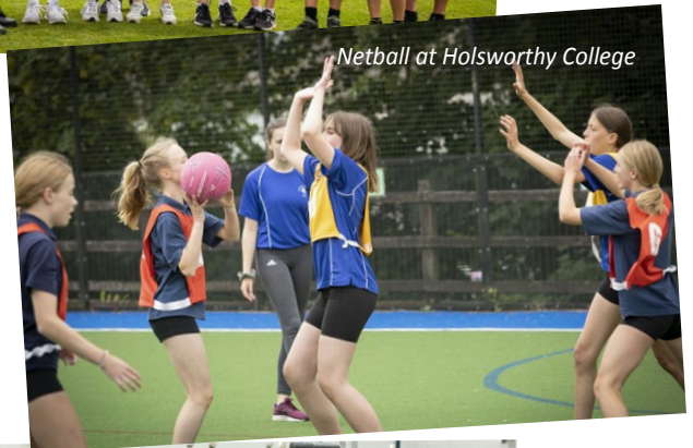
Netball at Holsworthy College