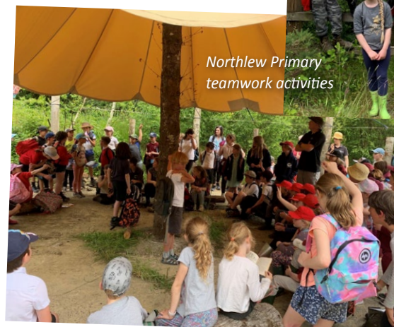
Northlew Primary teamwork activities

This newsletter is printed on paper made from virgin pulp, grown from sustainable sources