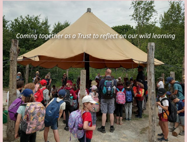
Coming together as a Trust to reflect on our wild learning

Our Wildlife Champions can now go back to school and share key messages with their peers as well as start to take action for wildlife themselves. The day provided an opportunity for fantastic team building, communication and making new friends.