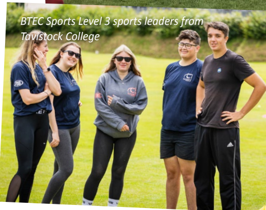
BTEC Sports Level 3 sports leaders from Tavistock College