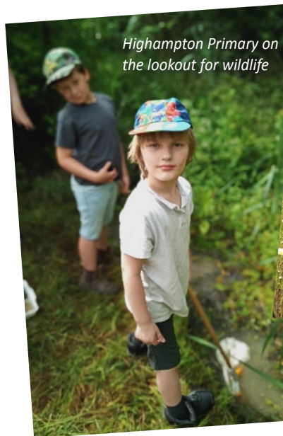
Highampton Primary on the lookout for wildlife