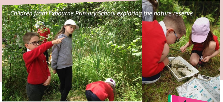
Children from Exbourne Primary School exploring the nature reserve