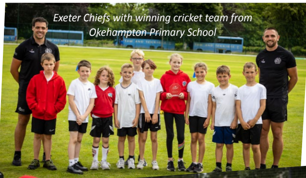
Exeter Chiefs with winning cricket team from Okehampton Primary School