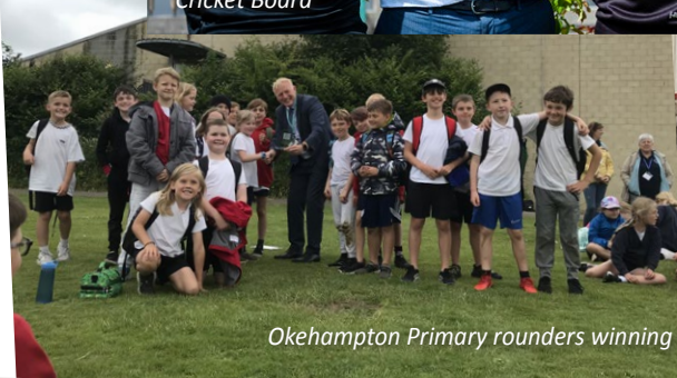
Okehampton Primary rounders winning team