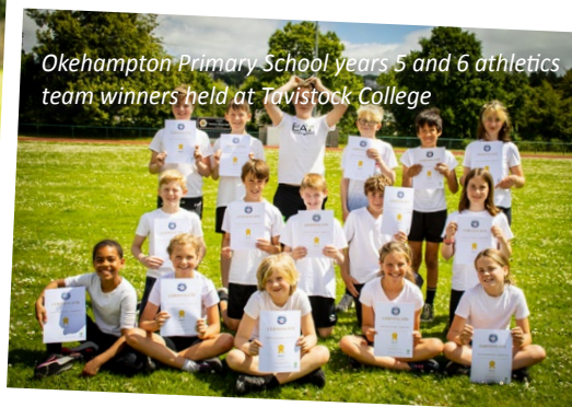
Okehampton Primary School years 5 and 6 athletics team winners held at Tavistock College