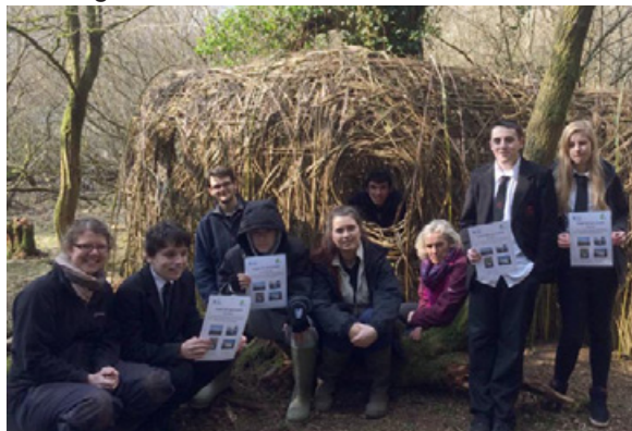
Year 10 and 11 Students carrying out volunteer conservation work experience at Burrator

Despite the weather, over the winter students have been coppicing, bird box making and willow weaving.