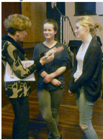
Professor Dame Carol Black inspiring students with her life story

On February 29 th , Tavistock College was delighted and privileged to receive a visit from Professor Dame Carol Black, she gave an inspiring and motivating talk to students. Dame Carol Black is currently Principal of Newnham College Cambridge; she talked to students about aspiration, inspiration and medicine, encouraging them to follow their passion and never give up.