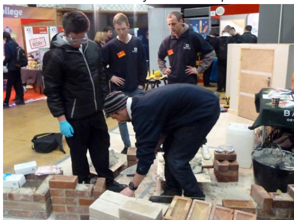
Students taking part in The Skills South West Careers Event at Plymouth Pavilions

Year 10 and 12 students attended the Skills Show South West Careers event at Plymouth pavilions. They were able to find out about a variety of different Career and Further education opportunities, talk with local employers and try out some career related activities.