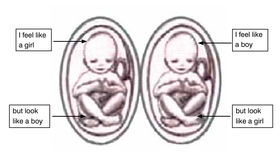
These babies may grow up to experience gender variance

Common language used to date suggests that trans people wish to be the 'opposite sex' and although this can be true for many people, this way of looking at sex and gender can be harmful as it suggests that there are only two ways of being (man or woman), and as we have just learned, that is not true, there are infinite ways of understanding one's gender and existing in the world.