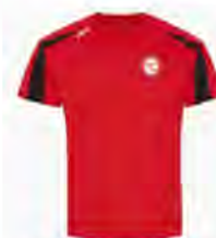
Tavistock College Athletics T-Shirt £14.95