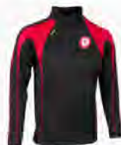
Tavistock College Athletics Midlayer £39.95